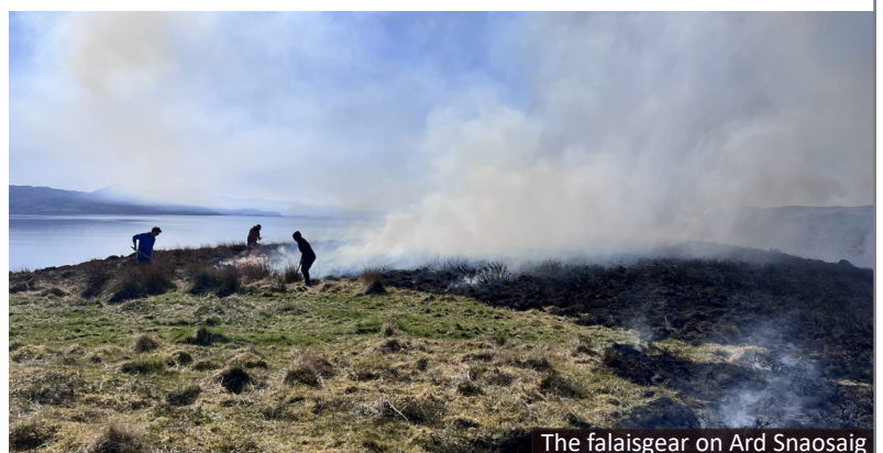
The falaisgear on Ard Snaosaig