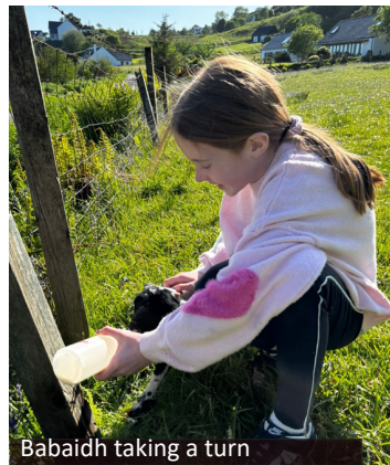
Babaidh taking a turn