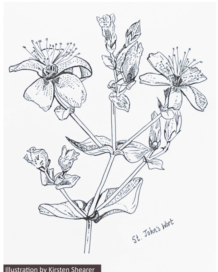
Illustration by Kirsten Shearer

A more secular age has put to flight the witches and malicious demons that St John's Wort was once believed to ward off. After they had disappeared, the flower was reputed to cure melancholia; today it is widely touted as a purported remedy for (mild) depression—albeit one with dangerous side effects if ill-advisedly mixed with certain medications. It is probably safer (and maybe just as effective) just to leave the flowers to bloom by the roadside.