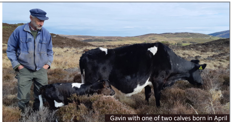
Gavin with one of two calves born in April

Residents and visitors to Camuscross will have been aware of the usual sights, sounds and smells of crofting in Spring and early Summer. Several exceptionally good dry spells allowed for much-needed rhododendron cutting on the main grazings and a muirburn on Ard Snaosaig. Those of us with sheep were particularly grateful for the good weather during lambing, which has always tended to take place a little later in Sleat than elsewhere. There were also calves born and they are looking good. Shearing has now gotten underway and soon the hill ground will be alive with freshly shorn sheep and anxious lambs eagerly exploring their new surroundings and getting a taste for heather. The Grazings Committee has a big year ahead as it prepares for new fencing and repairs on Àird Gunnail. This is a complicated and costly project, but absolutely essential to the viability of crofting in Camuscross.